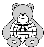
YISH Mascot Love Earth Bear