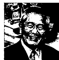
Purdue University Distinguished Professor Mr. Ei-ichi Negishi (Teijin Group Distinguished Fellow) 5th year Teijin Kumura scholarship (1957)

When you find your own "Dream", please challenge it thoroughly until the truth is investigated. I look forward to your great success in the future.